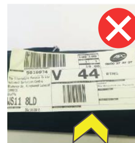
Never place on canvas