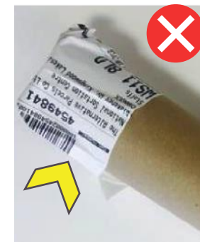
Never scrunch around tube end