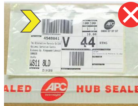
Never place in plastic wallet