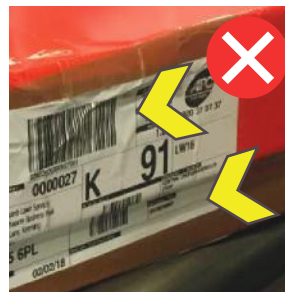
Never crease Never place over flap