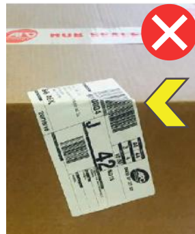
Never place over corners