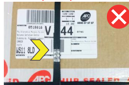
Never cover with strap